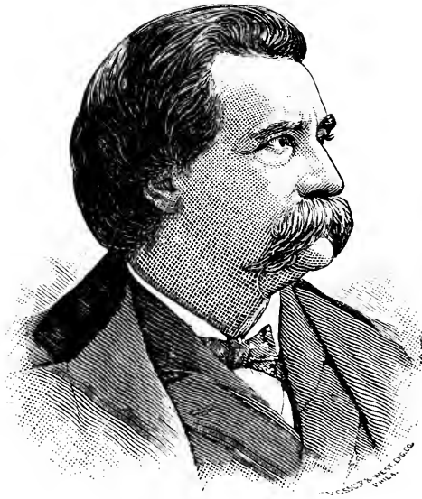
GEN. JOHN A. LOGAN